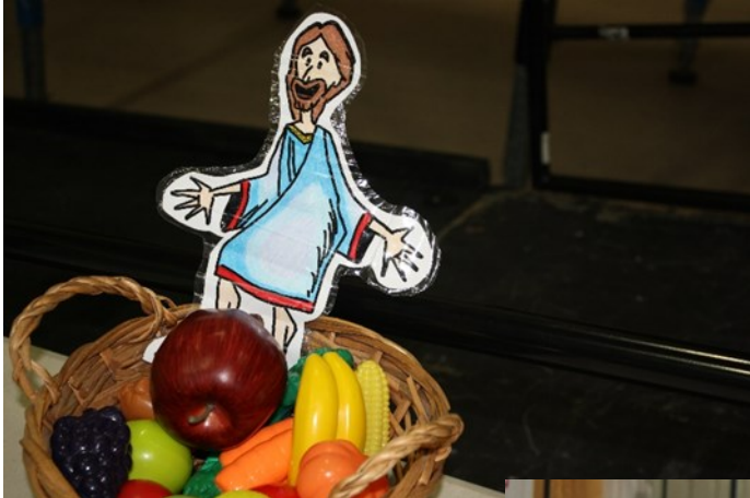
Flat Jesus preparing for his summer travels.