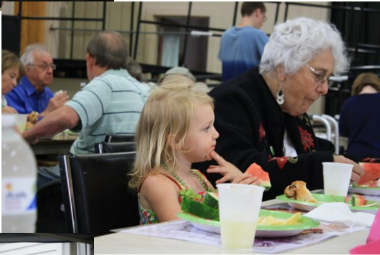
Delicious BBQ enjoyed by all generations!